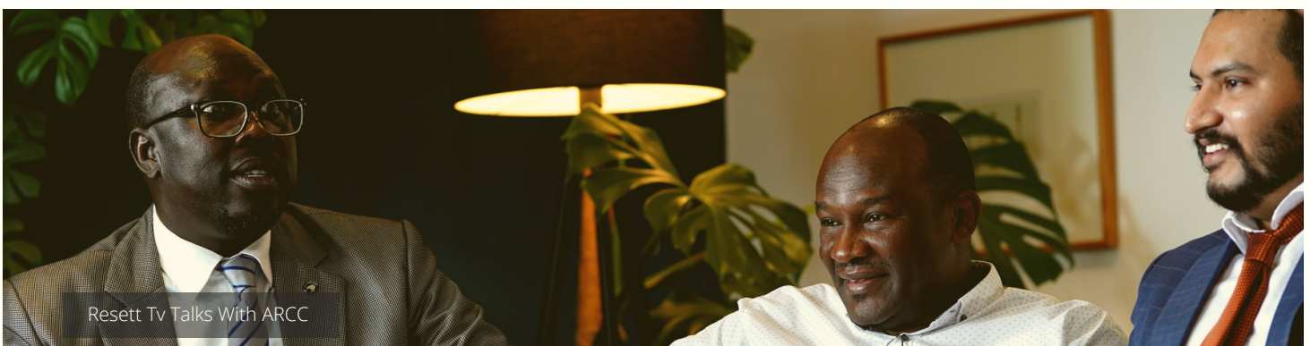
Resett TV Talks With ARCC