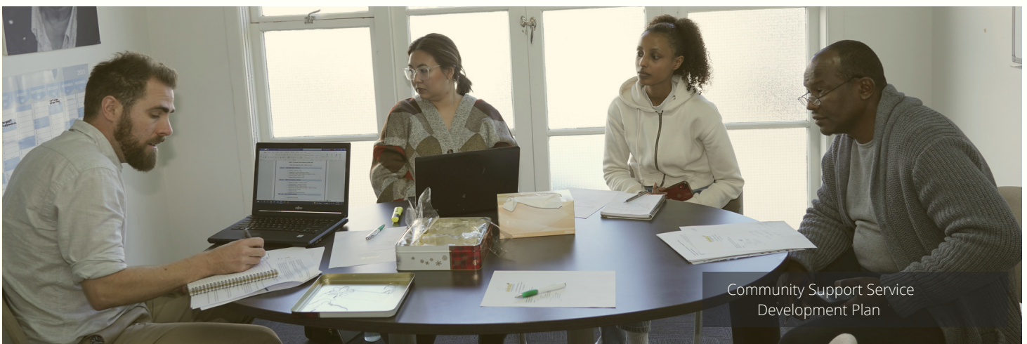
Community Support Service Development Plan