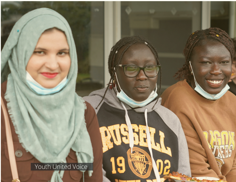
Youth United Voice