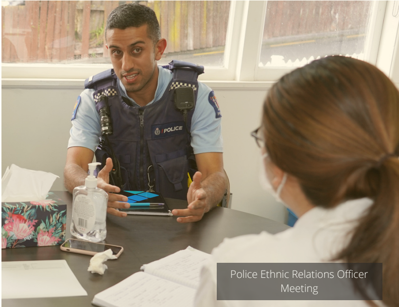
Police Ethnic Relations Officer Meeting