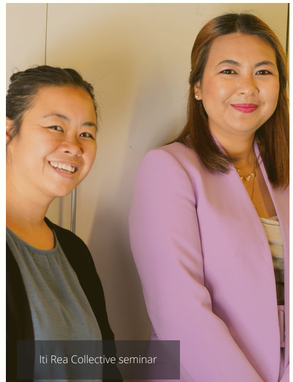
Iti Rea Collective seminar