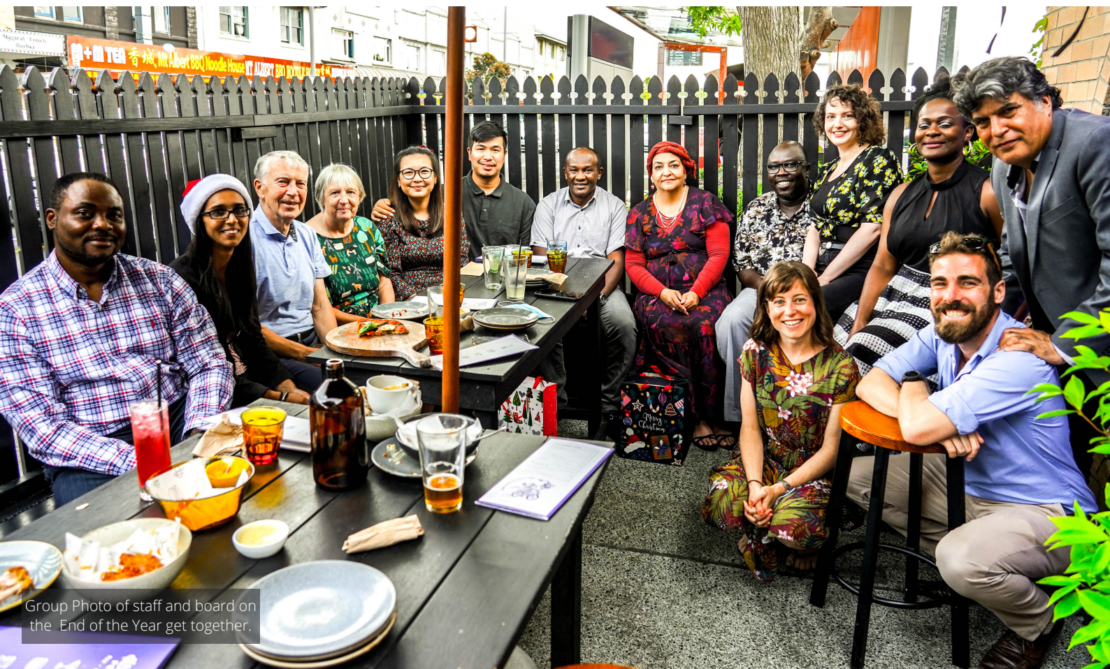
Group Photo of staff and board on the End of the Year get together.