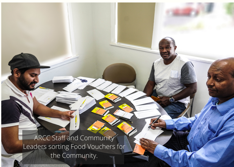
ARCC Staff and Community Leaders sorting Food Vouchers for the Community.

We will be facilitating an information/Q and A session about immigration, involving immigration experts. Invites will be sent out via email to communities and posted on Facebook once the event has been scheduled.