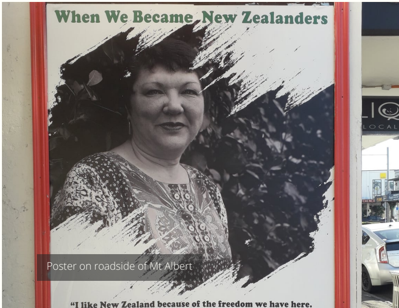
Poster on roadside of Mt Albert