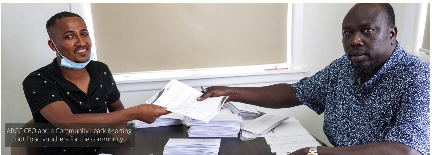
ARCC CEO and a Community Leader sorting out Food vouchers for the community