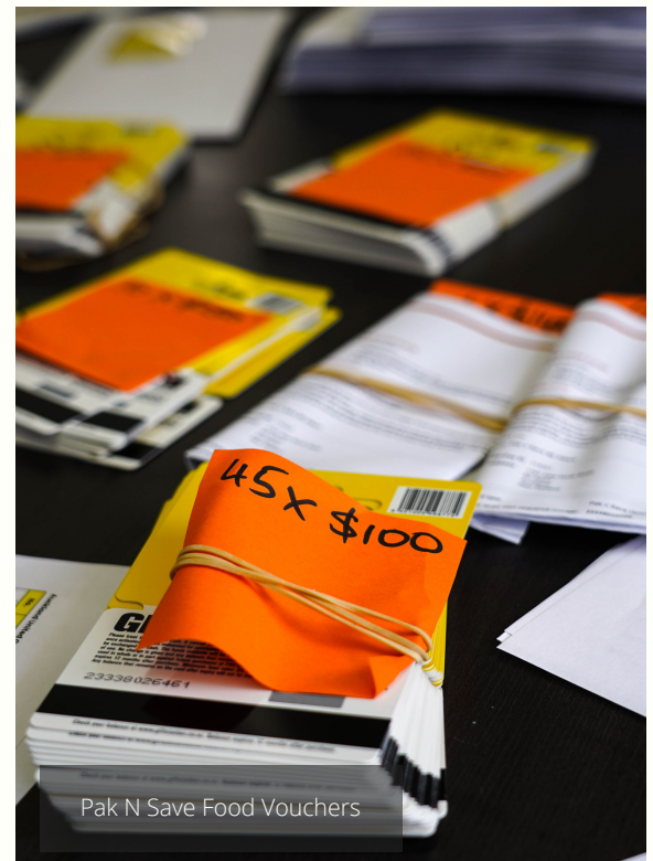
Pak N Save Food Vouchers